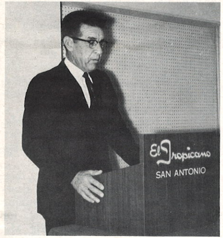
San Antonio Spokesman Club